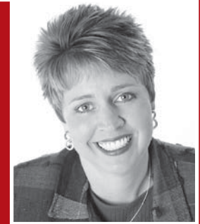
My Heart's at Home